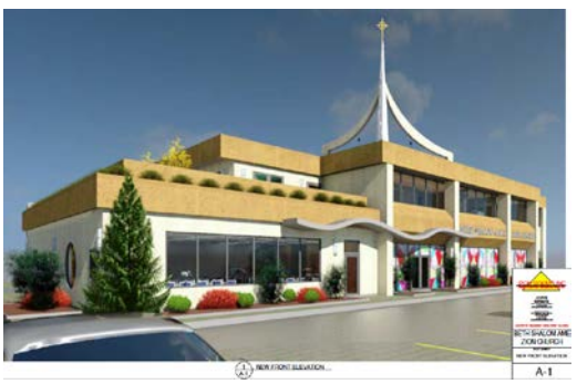
Share your plans with the Lord and you will succeed. Proverb 16:3 (CEV)

BETH SHALOM AME ZION CHURCH DJG@BSAMEZ © 12.16.2018