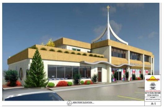
Pressing toward the Mark, Reaching Our Potential. Phil 3:14 (KJV)

Beth Shalom AME Zion Church 8100 Malcolm Road Clinton, MD 20735